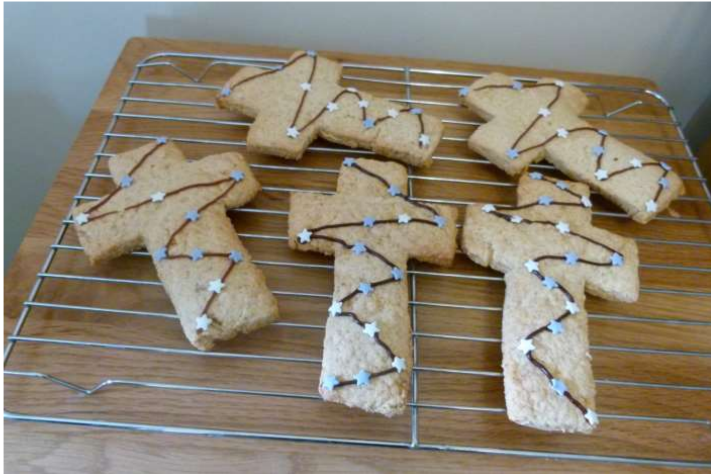
A gingerbread man recipe, cut into cross shapes using a cardboard template as a guide