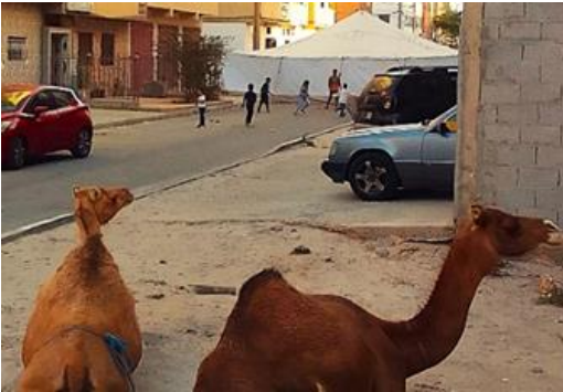
Camels and Tent.