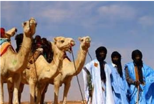
Local men in traditional clothing.